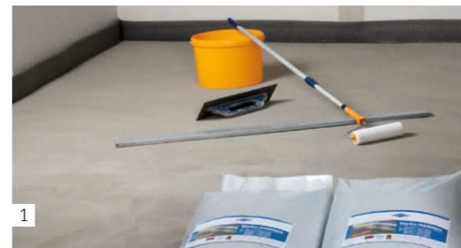
1 Before starting, lay out tools and material