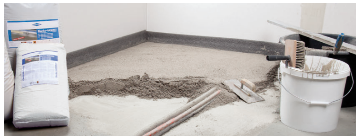
Easy incorporation of pipes and cables

BLANKE BASEMAX consists of a light filler in the form of expanded glass granulate and a cement-based bonding agent. Mixing with water creates the easy levelling from the two components which binds with the uneven surfaces - no matter whether concrete, screed, chipboard or wood flooring - it can be levelled from just 5 mm right up to 100 mm. BLANKE BASEMAX distinguishes itself through its extreme low weight properties, which only accounts to 25% of a comparable conventional screed. After just 12 hours, BLANKE BASEMAX is set and the Blanke flooring systems can be directly bonded and installed.