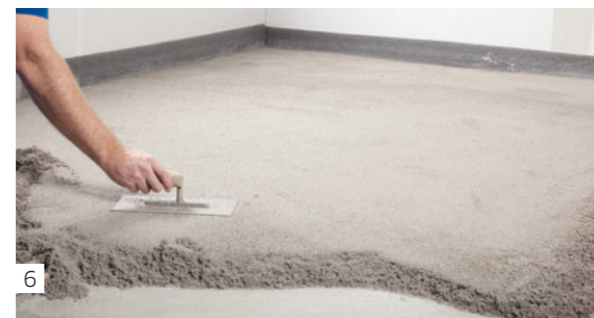
6 Smooth. Ready for installation after 12 hours