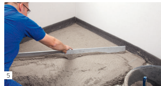
5 Compress and trowel up