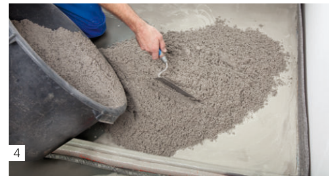
4 Spread the mixed BLANKE BASEMAX wet in wet