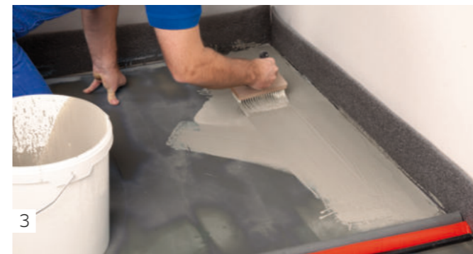
3 Application of the mixed adhesion bridge